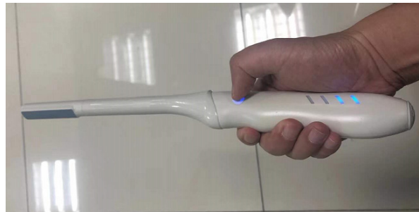
X Probe-N – Linear Probe with a Probe length of 20 mm with 7.5 or 10.0 MHz and a Scan Depth of 100 mm Suited for ewes and nanny's