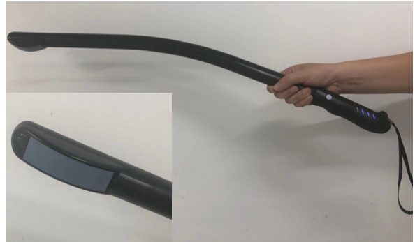
X Probe-C – Convex Probe with a radius of 60 mm with 3.5 or 5.0 MHz and a Scan Depth of 200 mm Suited for larger placentas in cows