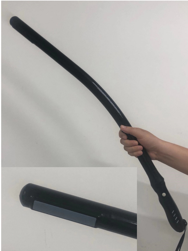
X Probe-L – Linear Probe with a radius of 64 mm with 7.5 or 10.0 MHz and a Scan Depth of 100 mm Suited for small placenta in cows