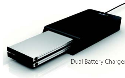
Dual Battery Charger